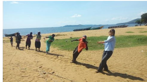
Fishing in village in Busia

Overall, this second phase of fieldwork has been largely successful!